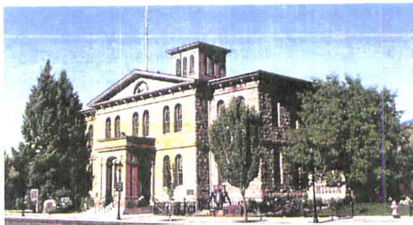
TOP: One-story plus-mansard-roof houses, like the 1875 Belknap House, are uncommon. Note the handsome pair of bay windows at the side. BOTTOM: The U.S. Mint, home of the famed Carson City silver dollar, was designed by Alfred B. Mullett using distinctive local sandstone. The 1869 building is now the Nevada State Museum.

coins--through modest settlers' homes, commodious Victorian mansards, and substantial Queen Anne houses.