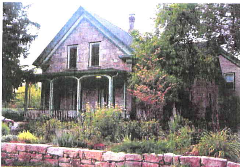
TOP: No fewer than three bay windows adorn the 1875 Olcovich-Meyers House, designed in a late Italianate style with Gothic Revival gables. ABOVE: The warm-toned local sandstone is used in major public buildings and in a few houses, including the circa 1883 Edwards House, where it was laid in a random ashlar pattern.

One-story L-shaped cottages enlivened by spindlework and Carpenter Gothic trim are representative of the respectable work-