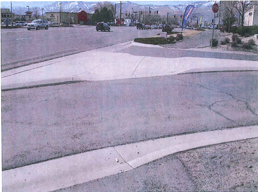
Example of Drive Area for Proposed Crosswalk Striping