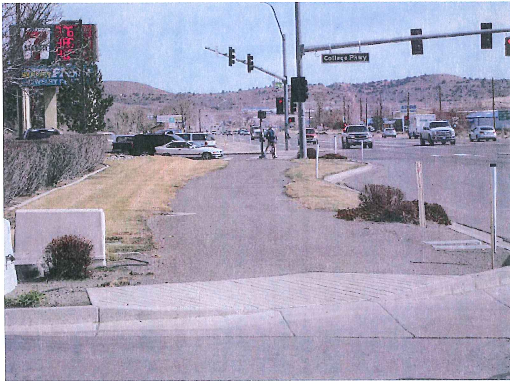
Looking East Toward College Parkway at East End of Project Limit – Area Proposed for Slurry Seal