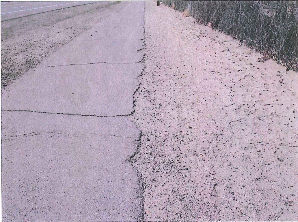
Asphalt Deterioration Along Edge of Path