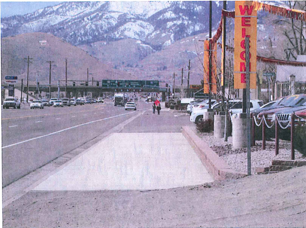
Example of Existing Concrete Path