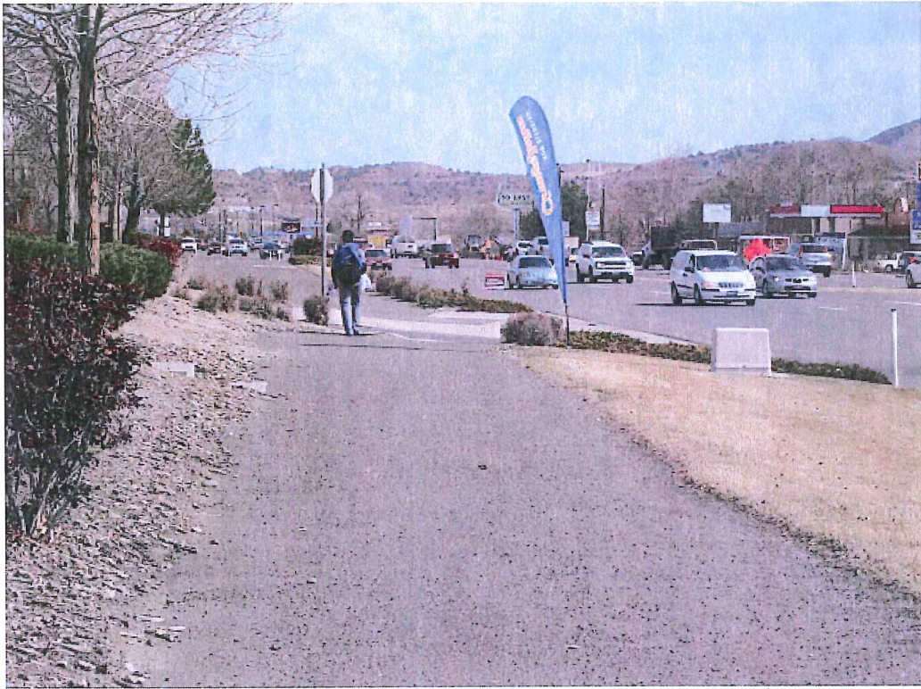
Example of Existing Section with Buffer and Landscaping