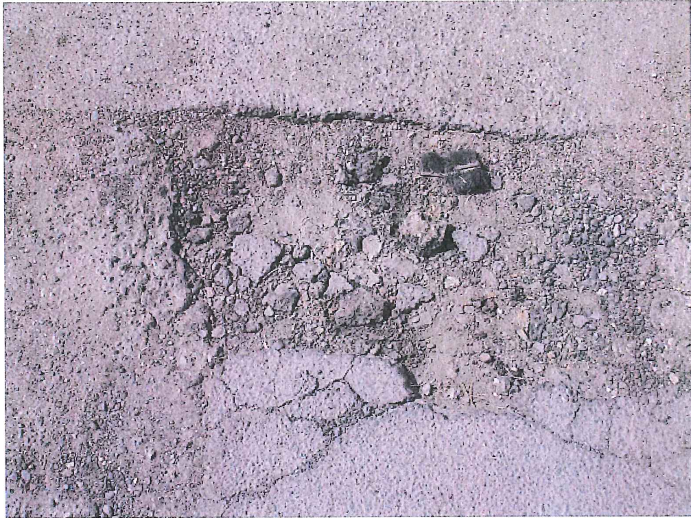
Typical Damage to Asphalt Proposed to be Replaced with Concrete