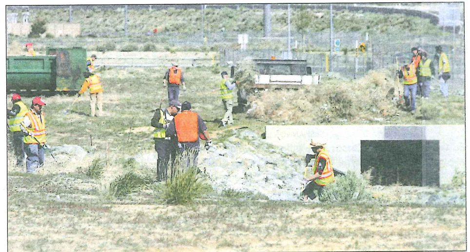
ABOVE: More than 30 volunteers from American Buildings participated in a community clean-up project near the Carson City multi-use pathway in front of Home Depot on College Parkway.