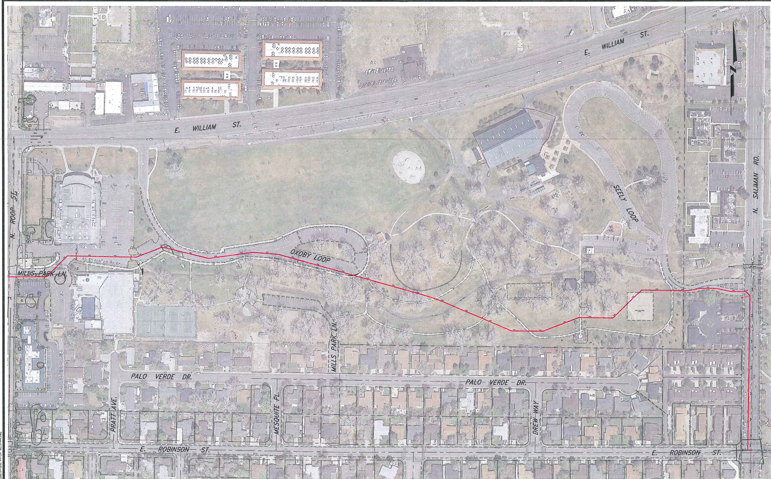
PLAN - MILLS PARK WATERLINE "WL1" SCALE: 1" = 100'