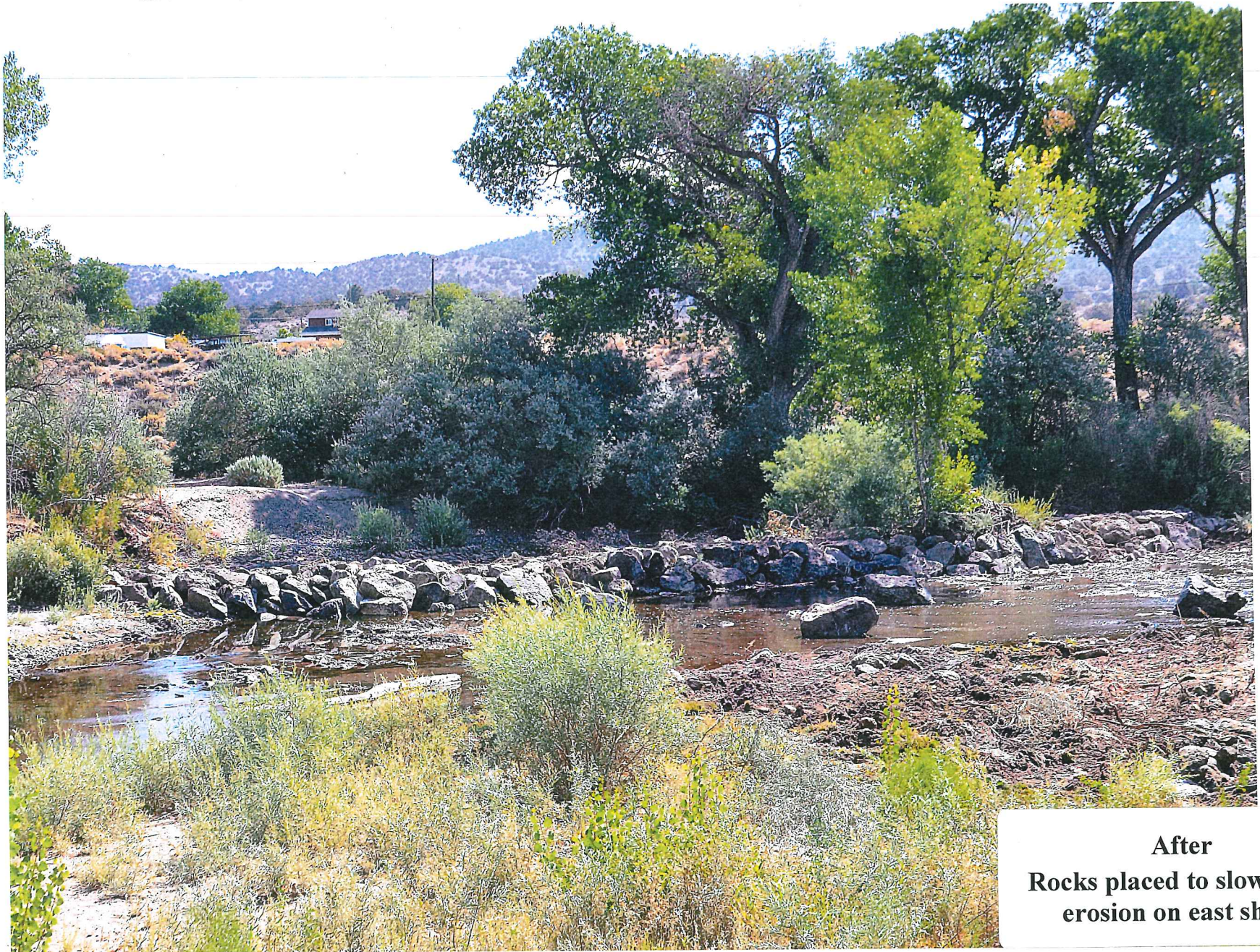
After Rocks placed to slow down erosion on east shore