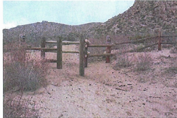
Hiker gates provide easy access on the west side of the Prison Hill Recreation Area in Carson City.