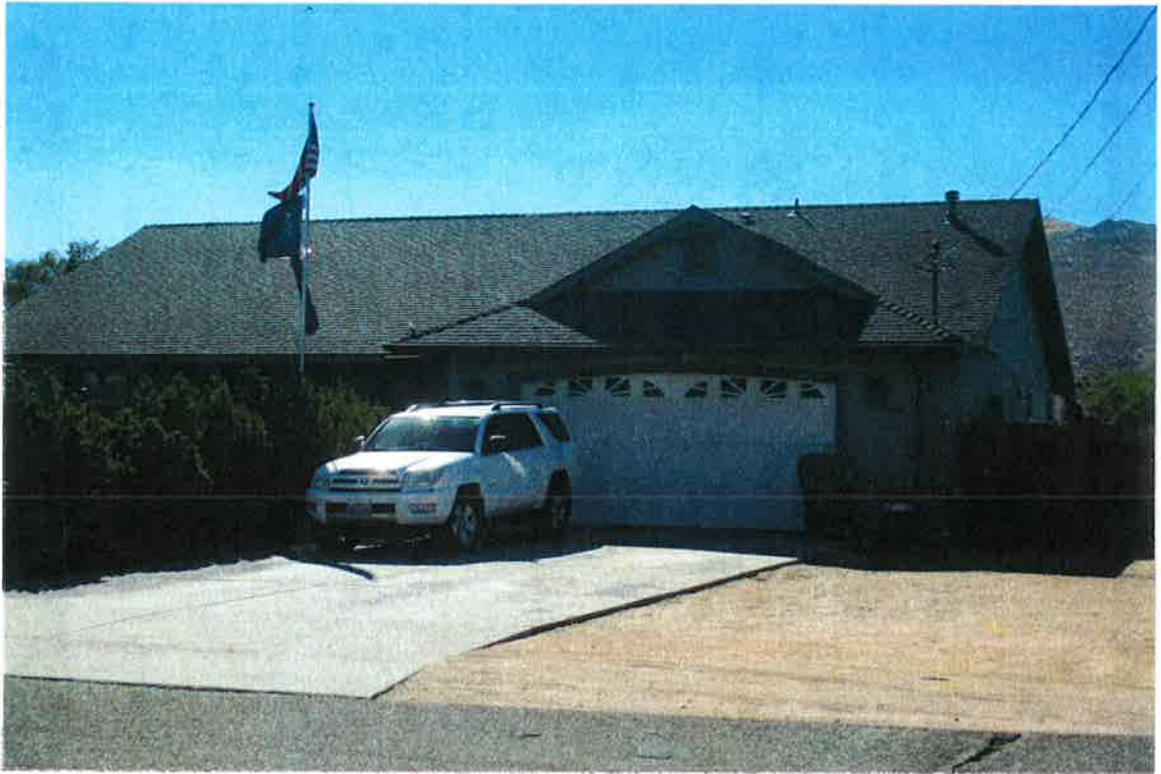
4830 SILVER SAGE DR.