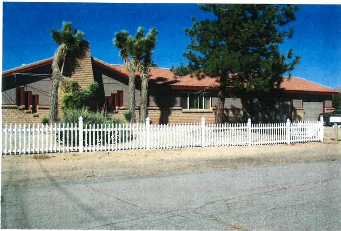
302 E. WILLOW ST. W/STEEL BLDG.