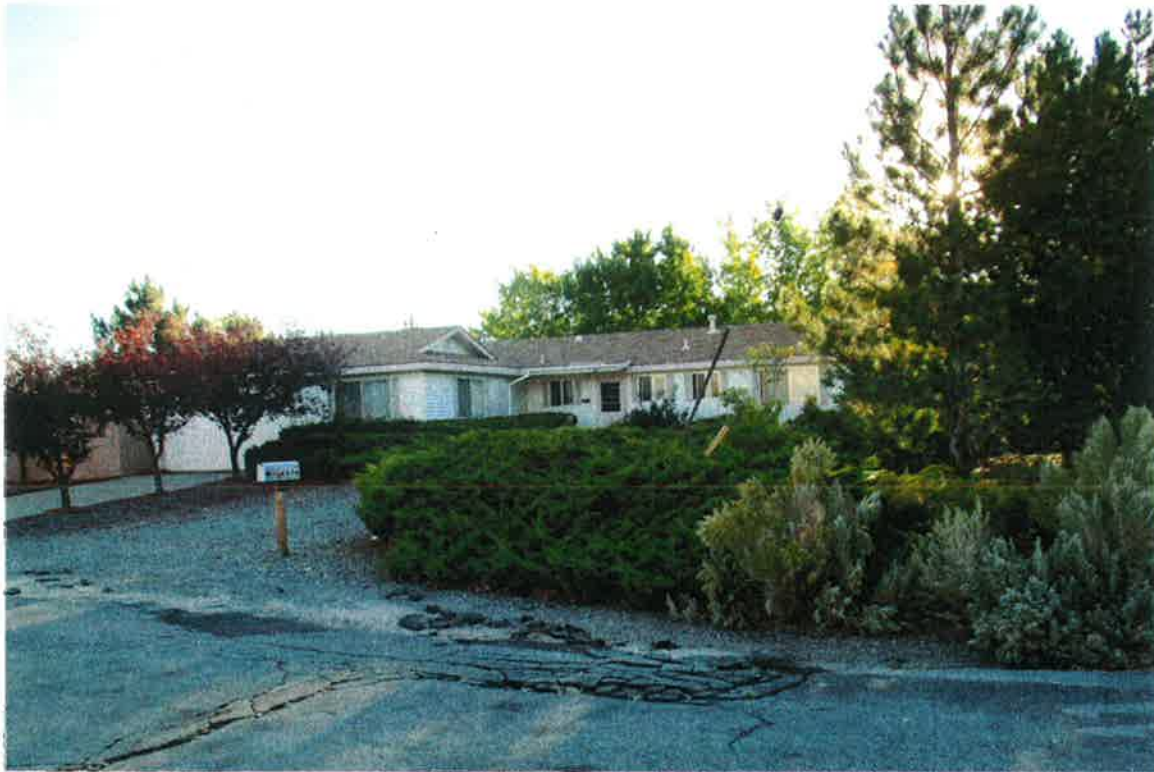
4521 CENTER DR.