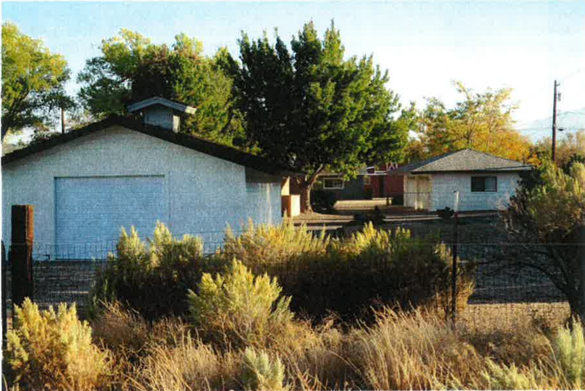
620 E. APPION ST. BARN