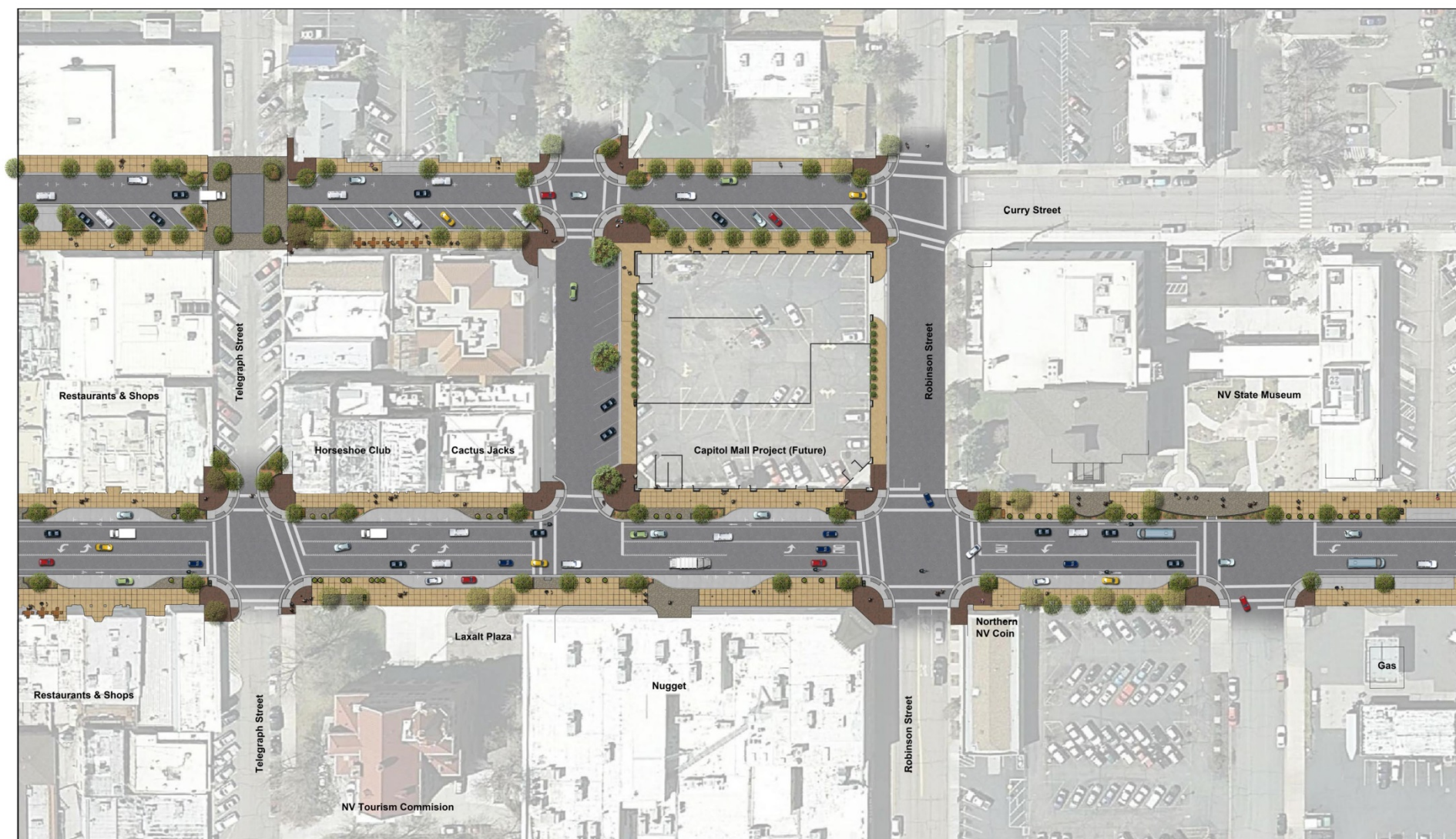
Carson City Downtown Streetscape Carson City, NV