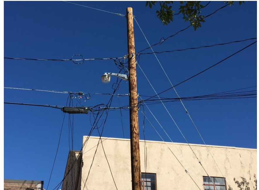
Existing Overhead Power