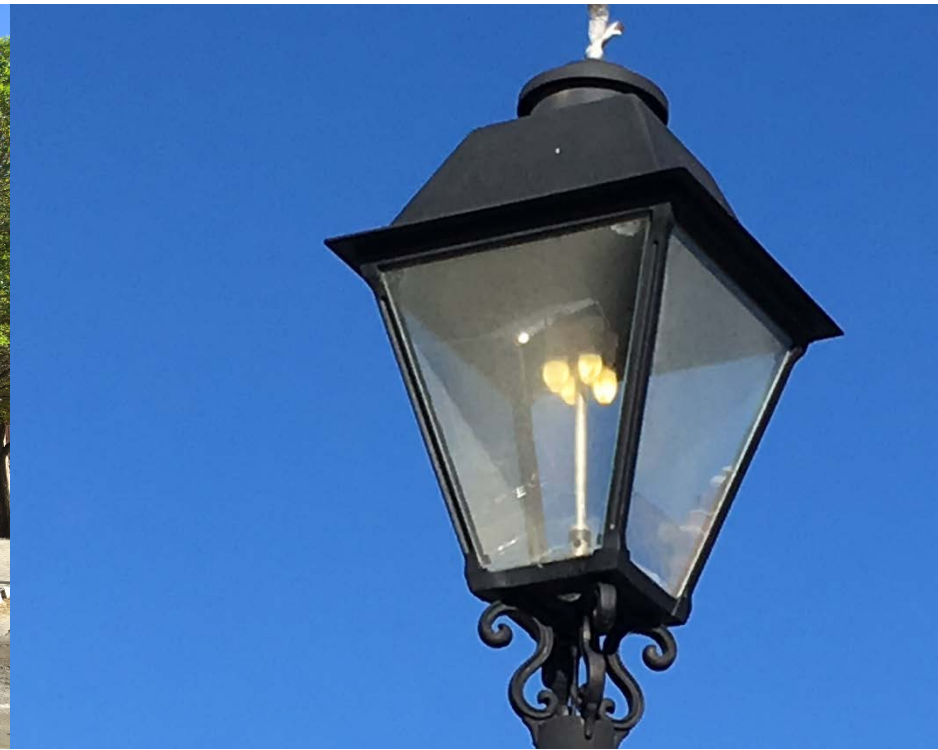
Existing Gas Street Lights