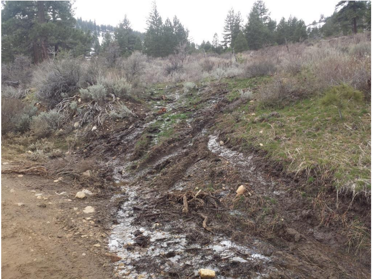
Photo 3: Resource damage from motorists circumnavigating sections of damaged road.