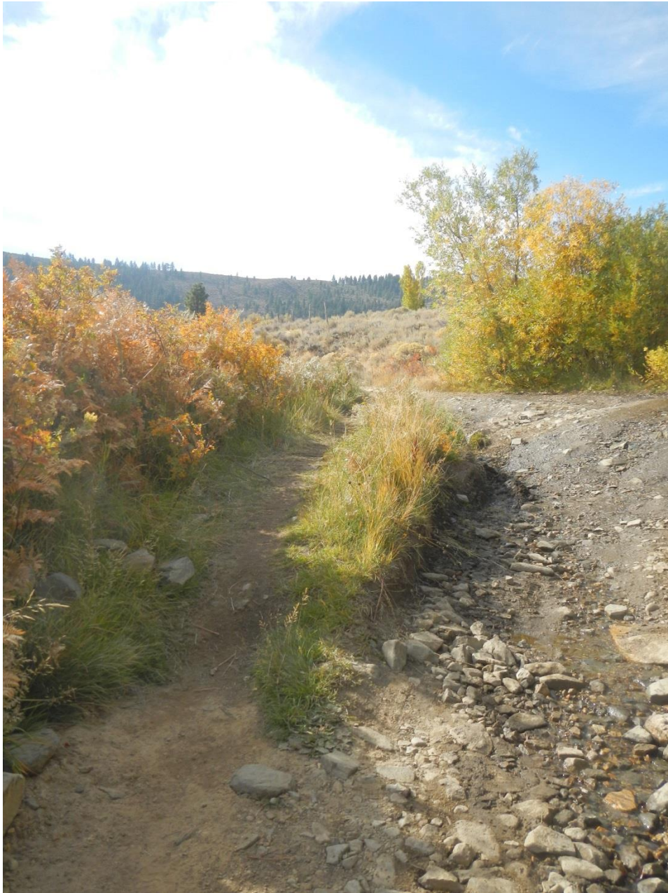
Photo 4: Resource damage from motorists circumnavigating sections of damaged road.