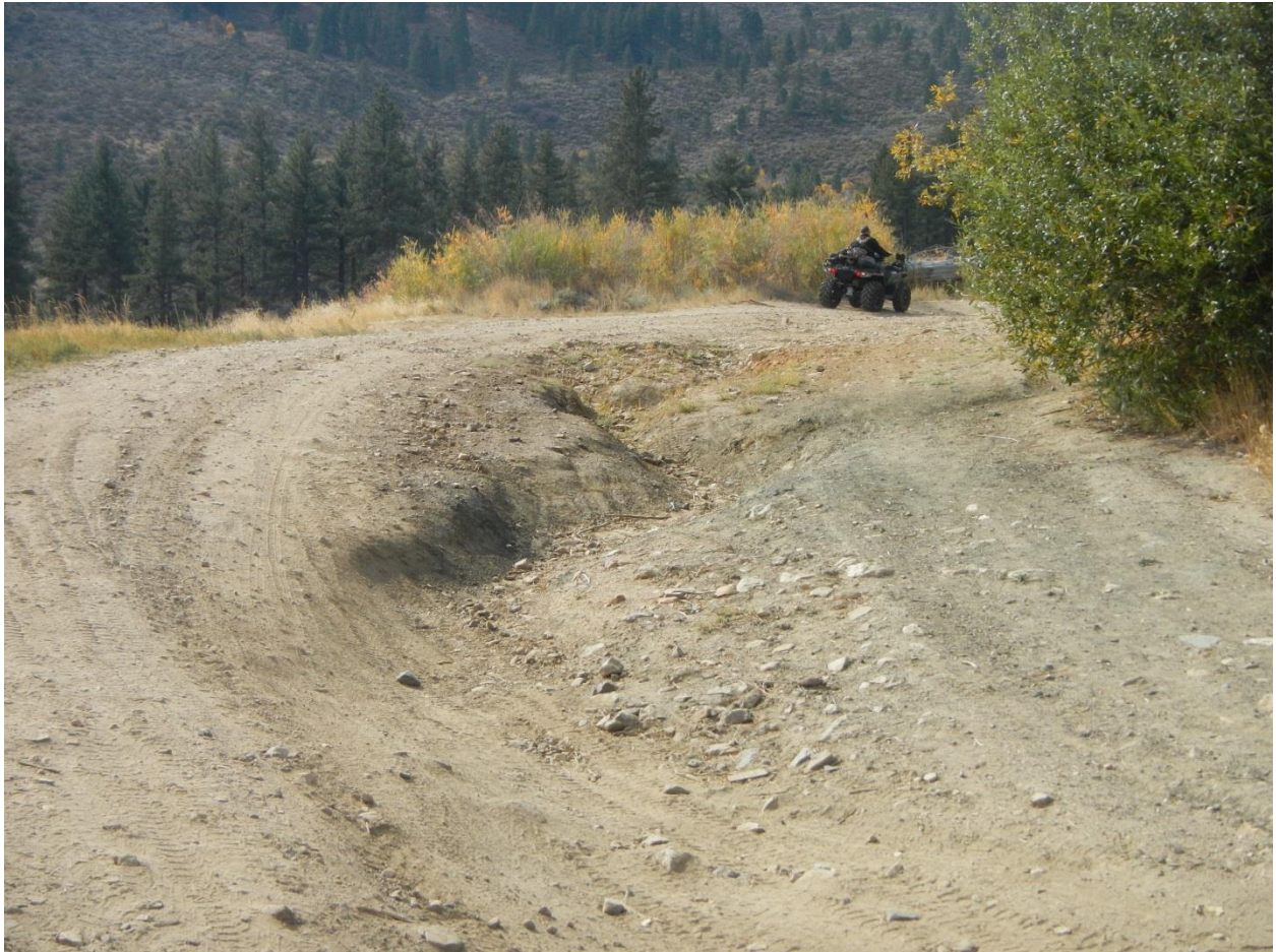
Photo 5: Extensive channeling in the road has resulted in widening of the road as motorists by-pass the damage.