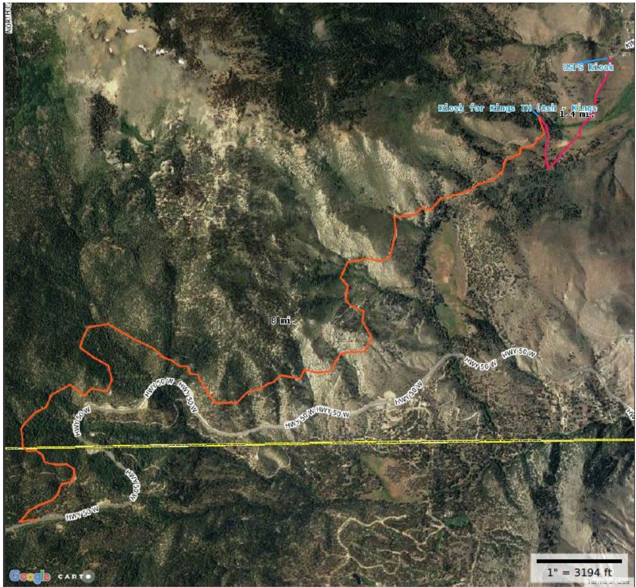
Aerial photo 1: Project area and existing facilities.