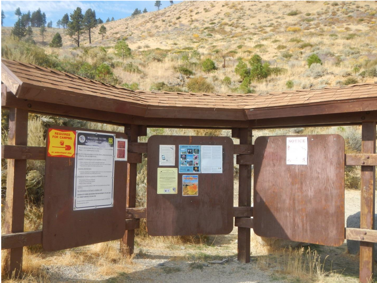
Photo 7: Existing USFS kiosk – located at beginning of Kings Canyon Road.