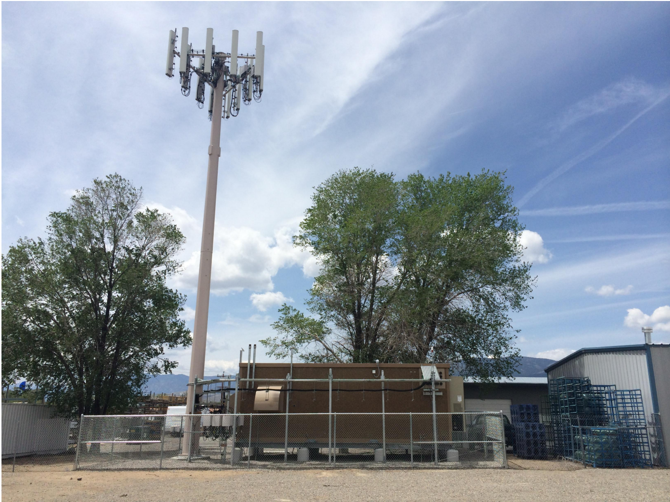
Side view (looking West)

If using the Elevation Certificate to obtain NFIP flood insurance, affix at least 2 building photographs below according to the instructions for Item A6. Identify all photographs with date taken; “Front View” and “Rear View”; and, if required, “Right Side View” and “Left Side View.” When applicable, photographs must show the foundation with representative examples of the flood openings or vents, as indicated in Section A8. If submitting more photographs than will fit on this page, use the Continuation Page.