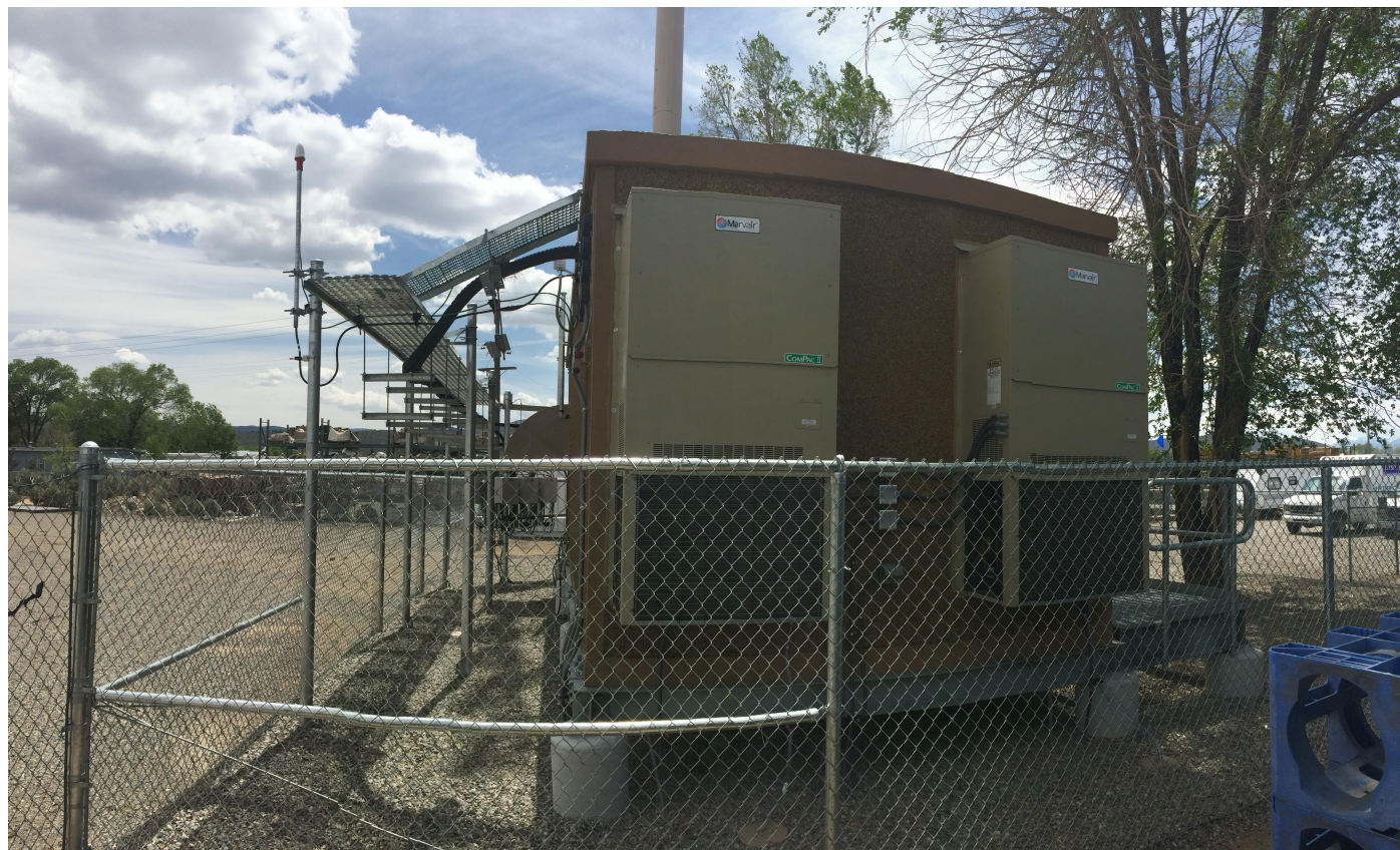
Side view (looking South)

If submitting more photographs than will fit on the preceding page, affix the additional photographs below. Identify all photographs with: date taken; "Front View" and "Rear View"; and, if required, "Right Side View" and "Left Side View." When applicable, photographs must show the foundation with representative examples of the flood openings or vents, as indicated in Section A8.