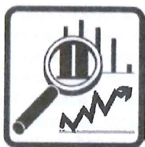
Figure 1. Key domains for transforming the nation's health and providing individuals with equitable opportunities to take charge of their health.