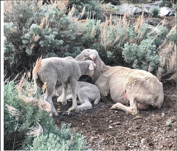
An ewe and lamb during 2020 grazing project.

ewes only to graze the lands north of Carson – specifically Lakeview, Vicee Canyon and behind WNC, and a second band comprised of lambs and ewes that focus in the usual project area – Greenhouse Garden Center, C-Hill and Kings Canyon. Coordinating two bands of sheep has allowed for more effective grazing across the entirety of the project area as we have been able to target cheatgrass during its prime palatability, resulting in more effective grazing. The sheep will be in Carson City through the end of May.