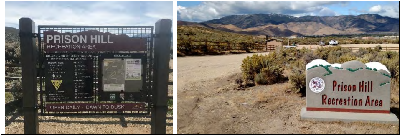
Newly installed kiosk signage and monument sign retrofit at Prison Hill, 5 th Street.