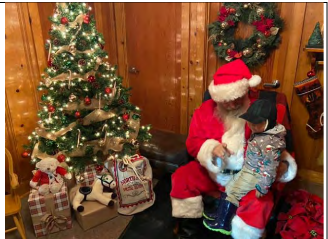
Children get the opportunity to tell Santa their wish list at the Homestead Holidays event.