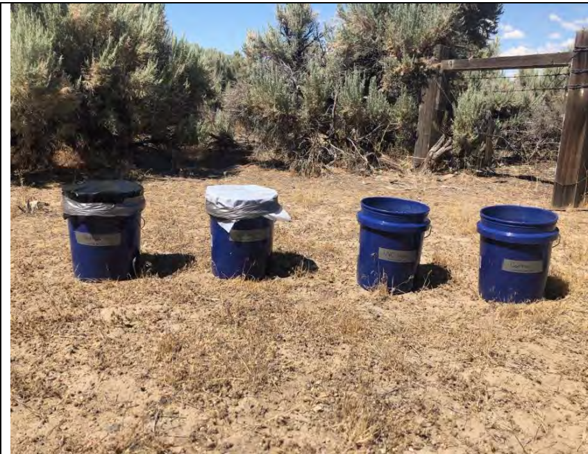
Eurasian watermilfoil experiment: occultation, solarization and UVC light treatments are respectively evaluated.