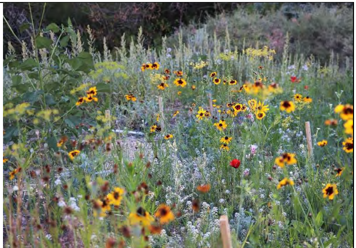
Blooms of the Foothill Pollinator Garden.