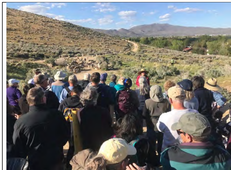
Nearly 70 participants came out to our “Trail Graze Hike” to learn about the sheep project (sheep pictured in the background).

In addition to the targeted grazing project, staff led the 2 nd annual “Trail Graze” hike in early May at the C-Hill Trailhead off McKay and Ormsby. Approximately 70 people, including children attended this event! We focused on teaching participants about the purpose and history of the sheep project in Carson City, natural history of sheep and much more.