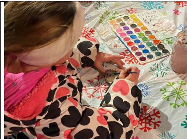
Children worked to make ornaments at Homestead Holidays.

Hosted by the Recreation Division, the first annual Homestead Holidays event was held at Silver Saddle Ranch in December 2019. The event featured a Christmas light display, wagon rides, food, crafts and entertainment. Over the course of three days, approximately 1,800 people visited Silver Saddle Ranch and participated in the event. Given the popularity and attendance, the Recreation Division hopes to host the event again next year.