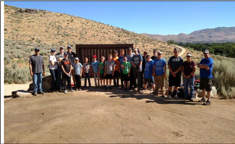
Volunteers and boy scouts standing in the newly improved C-Hill Trailhead.

Mr. Halen Harrison completed improvements to the C-Hill Trailhead, located at the west end of McKay Drive. Improvements included resurfacing the parking area, as well as applying and compacting an aggregate base. Additional work included refinishing the trailhead kiosk signage and removal of vegetation that was growing around the kiosk.