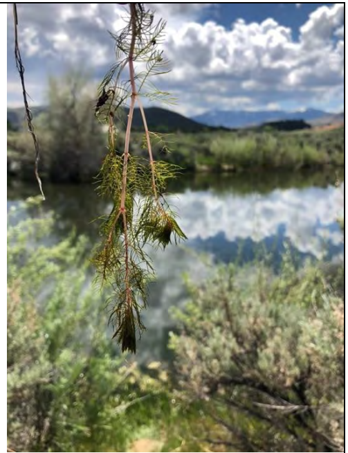
Eurasian watermilfoil from the Mexican Ditch.