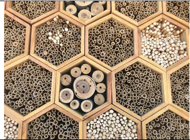
Close-up of the Mason Bee cells, many of which are 'plugged' indicating a Mason Bee inside.

In addition to the Bee Hotel, staff worked with the Carson-Tahoe Health and Greenhouse Project to create a pollinator garden at this site as well. The garden is located adjacent to the Serenity Stroll, a designated wellness trail administered by the Carson Tahoe Cancer Center. Several other organizations, including The Greenhouse Garden Center and Comstock Seed have assisted with various elements of the project, from donating seeds and seedlings, as well as expertise. We hope that with the combination of the unique projects in this area this site can become a central location for education opportunities, public engagement in pollinator conservation issues and solutions, as well as to learn more about food production.