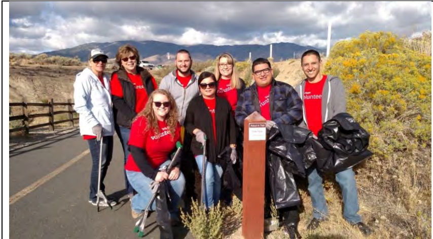
Wells Fargo volunteers on their adopted segment of the Mexican Ditch Trail.

In 2019, our AmeriCorps Volunteer Coordinator worked to create a program which encouraged organizations to assist the Department with volunteer trail maintenance, clean-ups and weeding, while increasing a sense of ownership among the community. Adopters who have signed up include Sierra Strength & Endurance, Boys & Girls Club of Western Nevada, Carson Senators Cycling, Kiwanis Club, Beards & Men, Wells Fargo and of course Muscle Powered. Signage to recognize adopters has been placed at trailheads.