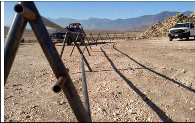
Jack Rail fencing installed to identify boundaries and restricted areas.