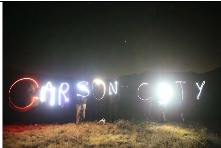
Carson City Park Rangers have fun with light photography on a Full Moon Hike.

Since 2017, staff have been working with AmeriCorps VISTA volunteers to build a robust interpretive program in Carson City. With the help and dedication of several VISTA members, 2019 was an exciting year for interpretation and education in Carson City, and we saw huge attendance at all programs. In 2019, staff led over 20 programs, including reoccurring Full Moon Hikes, Bird Watching Programs, Ranger Speaks Series and much more!