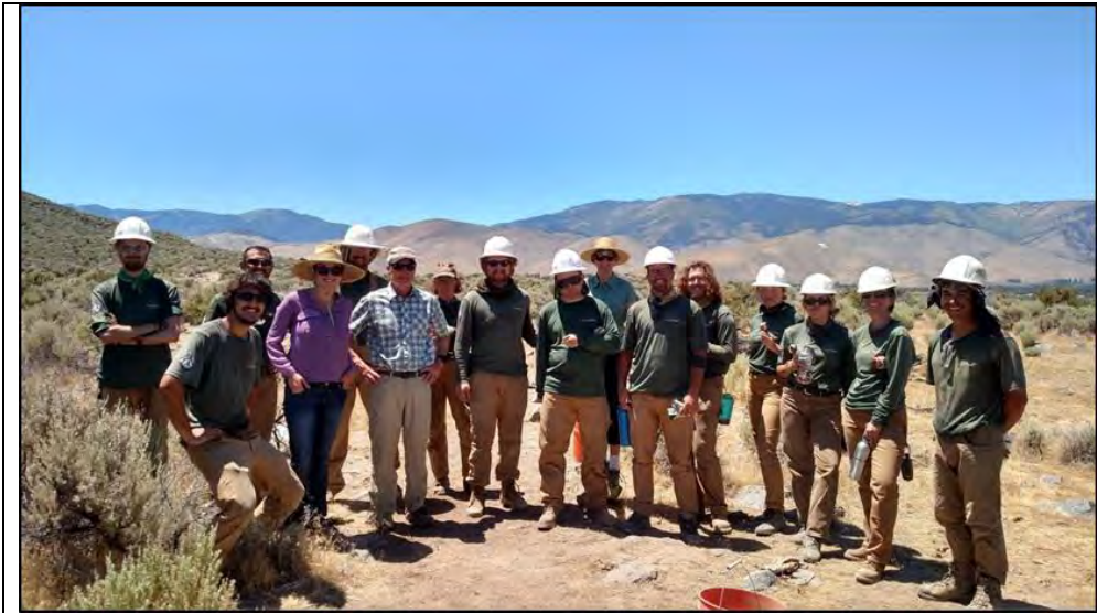
Nevada Conservation Corps and Open Space staff during a professional development training.

AmeriCorps volunteers from the Nevada Conservation Crew volunteered their efforts at Prison Hill, 5 th Street for the entire summer in order to assist us with new trail construction and road decommissioning. Temperatures on the north end of Prison Hill were typically 90 degrees or above throughout the summer, so Open Space staff occasionally treated them with ice-cream and cold water, as well as provided them with educational lessons on the flora and fauna of the region to contribute toward the crew's professional development while they were working with us.