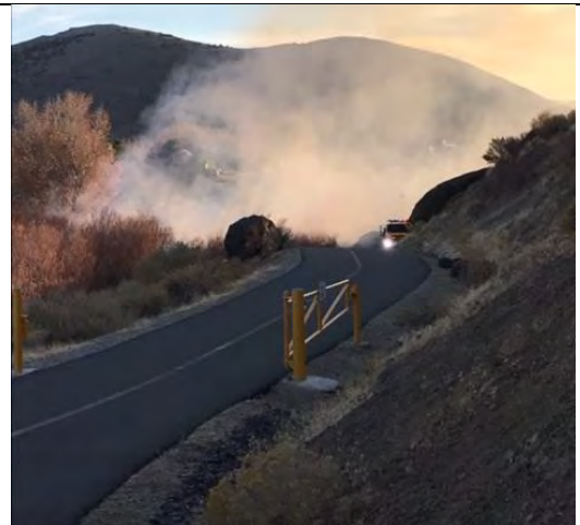
November fire at Moffat Open Space.