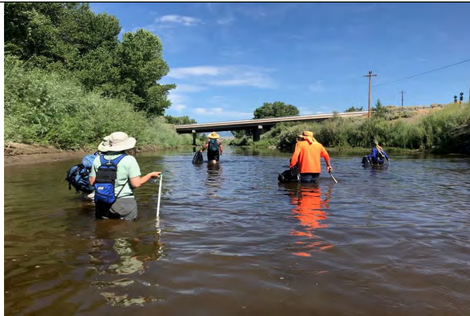
Open Space Team wade the Carson River with trash grabbers and bags to pick up several hundred pounds of garbage.