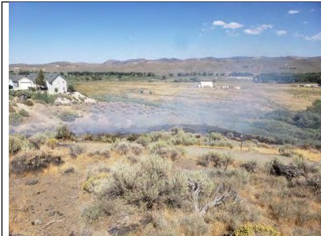
August fire at the Moffat Open Space.

Between August and November 2019, two separate fires have started on the slopes of Moffat Open Space, adjacent to the paved pathway that runs through the property. Both of these fires were small in size (less than one acre), however the frequency of the fires has suggested an anthropogenic cause. Later investigation by the Carson City Fire Department revealed that the most recent fire was intentionally started by juveniles, who have since been apprehended. Staff plan treated the burned area with a pre-emergent herbicide in the winter of 2019 to prevent annual invasive establishment and will follow-up with a native seeding in the fall of 2020.