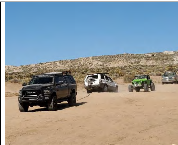
PNMTA volunteers work to remove the abandoned vehicle.

Approximately 15 students from the NJROTC assisted with cleanup of the lower canyons and along Golden Eagle Lane as well. This clean-up was completed in advance of the National Off-Highway Vehicles Conservation Council (NOHVCC) Conference in Reno which included a mobile workshop at Prison Hill OHV Area for conference attendees. The mobile workshop was attended by approximately 100 people and included a discussion of the Prison Hill OHV Area project, equipment displays, and vehicle demonstrations.