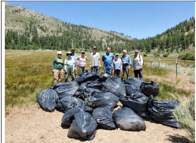
Volunteers stand behind the 28 bags of bull thistle they worked to remove.

Each year, Carson City Open Space partners with Muscle Powered for one of their monthly “Trash Mob” volunteer events to pull the invasive plant bull thistle from the meadows of Horsecreek Ranch. This pristine and beautiful property is under a conservation easement held by Carson City, and typically public access to this property is prohibited. However, every July, we allow a small group of volunteers the opportunity to see this amazing place while assisting with important invasive plant removal work on the ranch. This year, there were a total of 10 volunteers, including staff. Together, this small but mighty group removed 28 bags of bull thistle from the meadow.