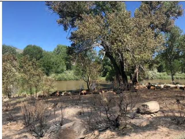
Burned and damaged cottonwoods and shrubs from June 2019 fire.