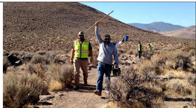
Carson City Parks, Recreation & Open Space staff work together to revegetate disturbed areas at Prison Hill, 5 th Street.