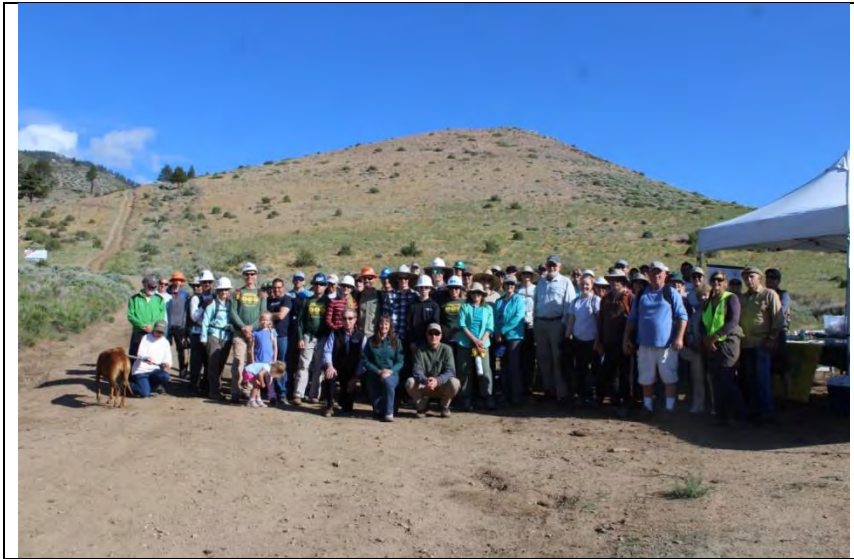
National Trails Day participants gather to take a guided hike or help build a new section of a trail.

Approximately 25 volunteers from Muscle Powered, Great Basin Institute and the Tahoe Rim Trail Association helped build the new trail segment.