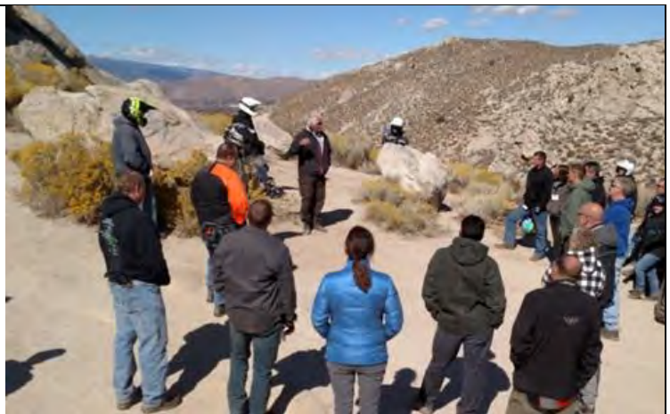
Mobile workshop participants learn about the Prison Hill Recreation Area OHV Project.