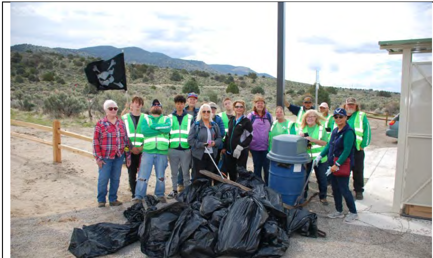
Muscle Powered Trash Mob volunteers remove 360 pounds of trash at East Silver Saddle Ranch.

Muscle Powered continues to be one of our strongest volunteer partnerships throughout the City. Each year, they assist with the maintenance and management of nearly all single-track dirt trails, in addition to new trail construction as well. In addition to trail activities, Muscle Powered also holds a "Trash Mob" each month to pick up trash in both Open Space and Parks. We greatly appreciate all of Muscle Powered's efforts in helping us maintain and enhance our beautiful Open Spaces.