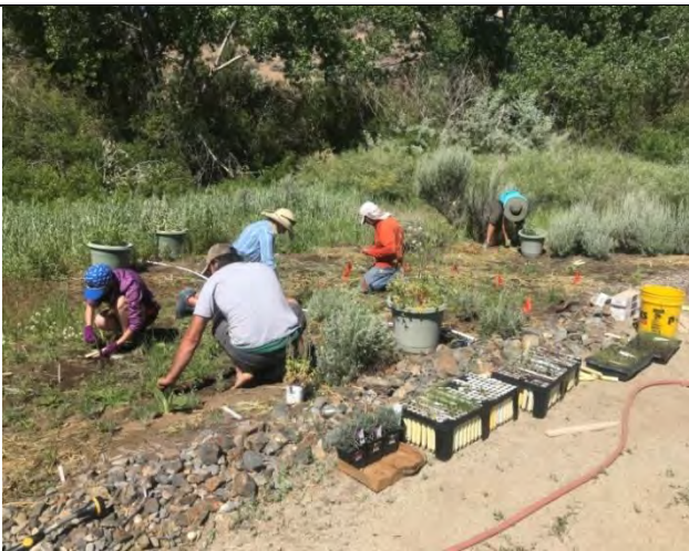
Volunteers planting native flowers in the Foothill Pollinator Garden.

In addition to the Bee Hotel, staff worked with the Carson-Tahoe Health and Greenhouse Project to create a pollinator garden at this site as well. The garden is located adjacent to the Serenity Stroll, a designated wellness trail administered by the Carson Tahoe Cancer Center. Several other organizations, including The Greenhouse Garden Center and Comstock Seed have assisted with various elements of the project, from donating seeds and seedlings, as well as expertise. We hope that with the combination of the unique projects in this area this site can become a central location for education opportunities, public engagement in pollinator conservation issues and solutions, as well as to learn more about food production.