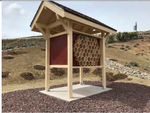
Bee Hotel constructed by the Chamber of Commerce Leadership Class of 2019.

In celebration of the 2018 Bee City USA #76 designation in Carson City, the 2019 Carson City Chamber of Commerce Leadership Class completed a bee habitat project near the Greenhouse Project at the Foothill Trail. The Chamber Leadership group worked to design and build a Bee Hotel, which will provide habitat for both mason, and leaf-cutter bees. These bees will help pollinate the fruits and vegetables growing in the adjacent Greenhouse Project. In addition to the habitat, the Chamber Leadership Group also worked to create interpretive panels about pollinator conservation, so residents can see the bees hard at work and learn more about organic food production and pollinator conservation before hiking the Foothill Trail.