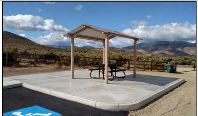
Newly installed vault toilet, ADA parking stalls and picnic shelter.

In addition to the trail realignment, staff got together to complete revegetation activities at Prison Hill, 5 th Street as well. In October 2019, Carson City Parks, Recreation & Open Space Department had an all-staff workday, where they worked to install stray bales for erosion control, as well as to seed decommissioned roadbeds with a native seed blend.