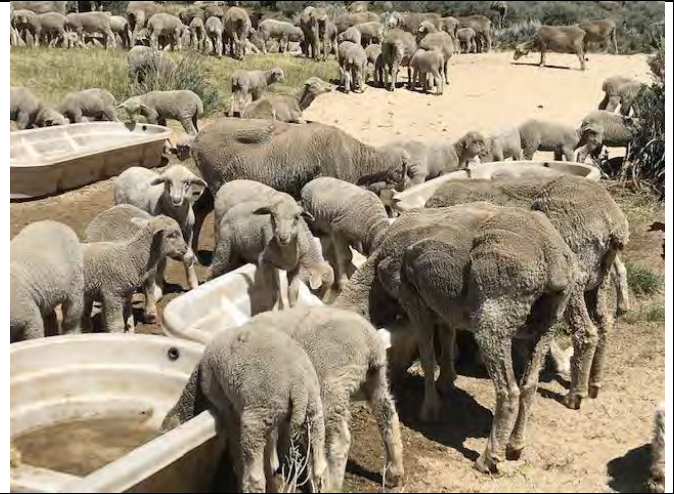
Lambs and ewes grazing and watering while on C-Hill.

In addition to the targeted grazing project, staff led the 2 nd annual “Trail Graze” hike in early May at the C-Hill Trailhead off McKay and Ormsby. Approximately 70 people, including children attended this event! We focused on teaching participants about the purpose and history of the sheep project in Carson City, natural history of sheep and much more.