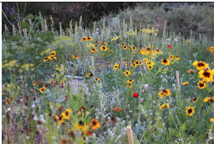
Late season blooms at the Pollinator Garden.

In conjunction with the Bee Hotel, Carson City staff worked with the Carson-Tahoe Cancer Center and The Greenhouse Project to grow native flowers and plant them in a garden adjacent to the new Bee Hotel to provide forage for the bees. This garden is also adjacent to the 'Serenity Trail' which is prescribed as a wellness trail to patients and their families by the Carson-Tahoe Cancer Center.