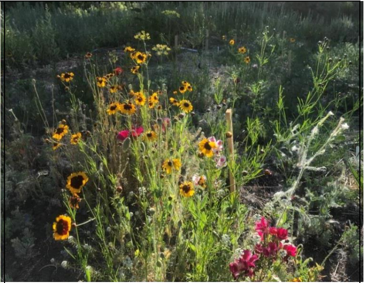
A colorful palette to feed diverse pollinators.