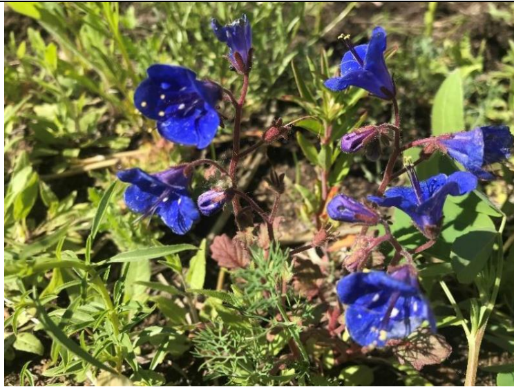
California Bluebells flowering.