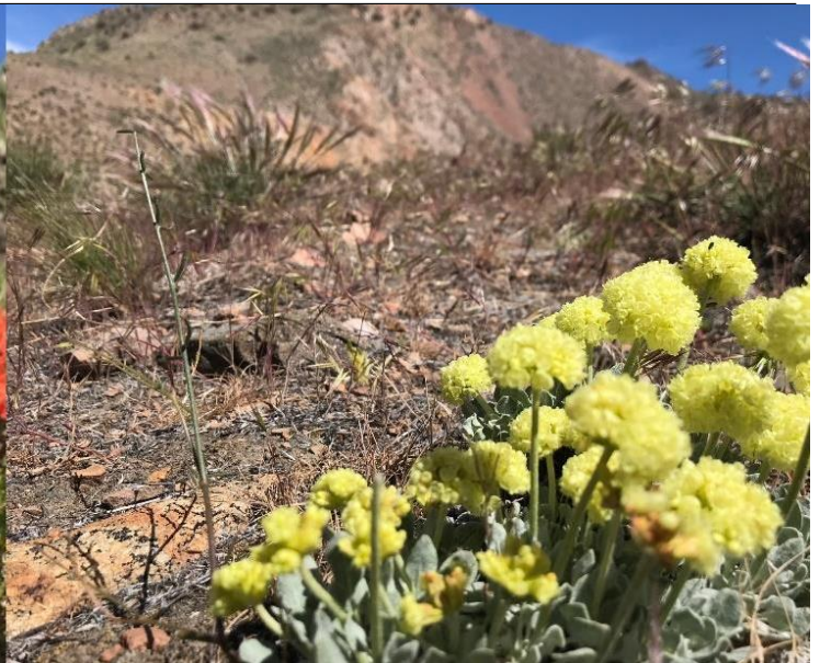
Great Basin native forbs Indian Paintbrush (left) and Cushion Buckwheat (right) growing after wildfire.