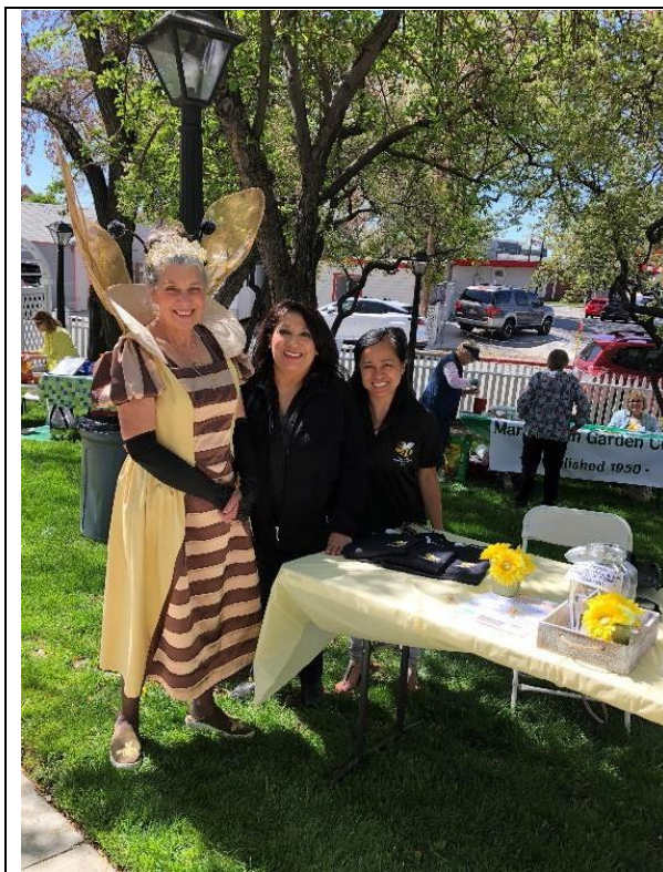
Great Basin Beekeepers of Nevada and Chamber Leadership group.

2019 Earth Day was co-sponsored by the Great Basin Beekeepers of Nevada and the Carson City Historical Society and held the theme "Celebrating Pollinators" to teach residents about our recent Bee City designation, as well as pollinator conservation practices. The day also featured guest speakers who spoke about Integrated Pest Management and chemical reduction strategies, planting for pollinators and climate change impacts to pollinator conservation.