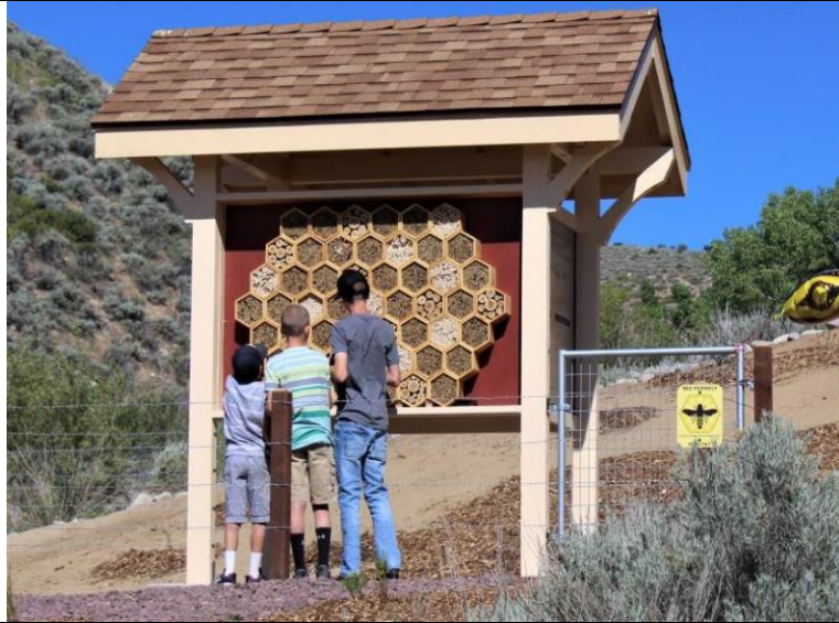
Children enjoying the newly installed Bee Hotel.

Following Carson City's designation as a Bee City USA in 2018, the 2019 Carson City Chamber Leadership group wanted to complete a project dedicated to pollinator conservation. As a result, they designed and installed a Bee Hotel at our Foothill Garden Site – an area that already supported sustainable agriculture and food production in Carson City. Now, with the inclusion of the Bee Hotel the Foothill Garden has become an amazing site for children and adults alike to learn more about the connection between our food and pollinator services.