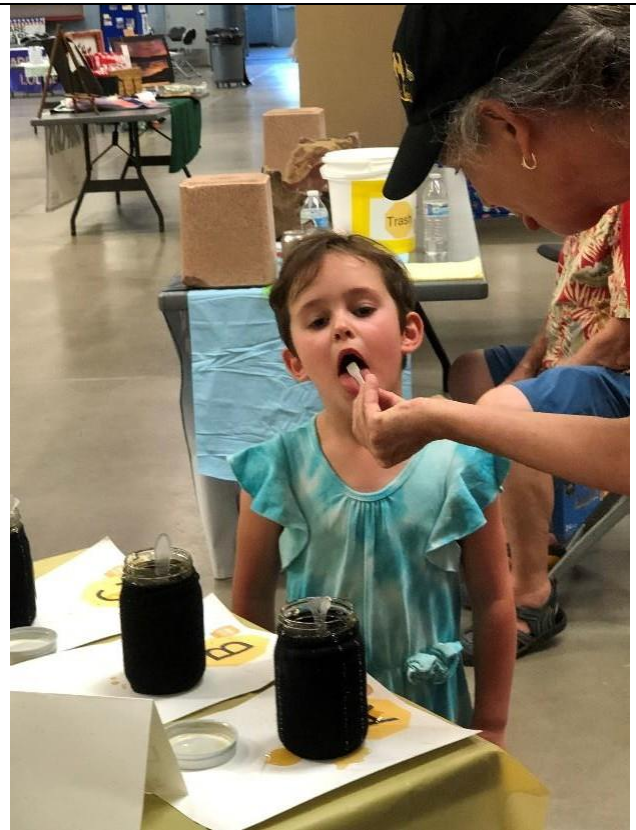
Honey tasting with children.