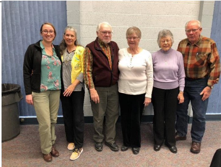
Original Carson City Bee City USA #76 Executive Committee.

Summary: After designation as a Bee City USA, Carson City worked to form a group of committee members to help guide the program. The committee is made up of Carson City staff and Great Basin Beekeepers of Nevada members who were integral to the Bee City designation process. The Carson City Bee City USA #76 Committee held four public meetings – January, April, July and October – to help educate the public about the Bee City Program, Introduction to Beekeeping, as well as a special event held at Greenhouse Garden Center to educate the public on protecting pollinators in their yards during fall clean-up. We look forward to engaging the public similarly in 2020.