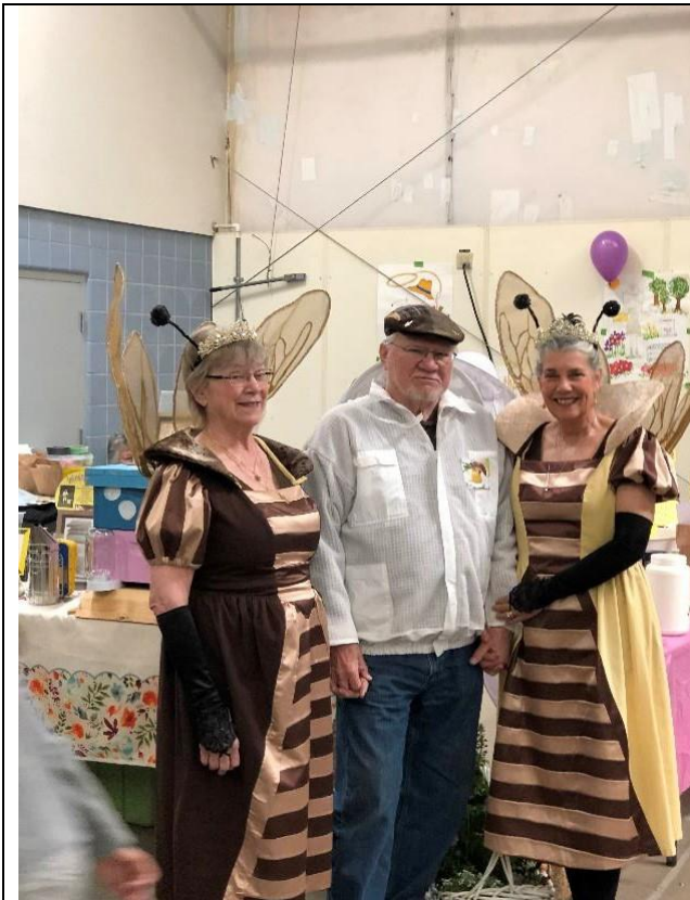
Great Basin Beekeepers of Nevada leaders and Bee City USA #76 Executive Committee members.

Farm Days is an annual education event for pre-K to elementary aged children. The focus of the event is animal husbandry and agriculture and is a very important event for groups like the Great Basin Beekeepers of Nevada (GBBN). Approximately 2,000 children participate in the event each year, and with the help of GBBN they learn about how important bees are to pollinate the one in three bites of food we eat. Additionally, they get the opportunity to taste some delicious local honey while they are there.