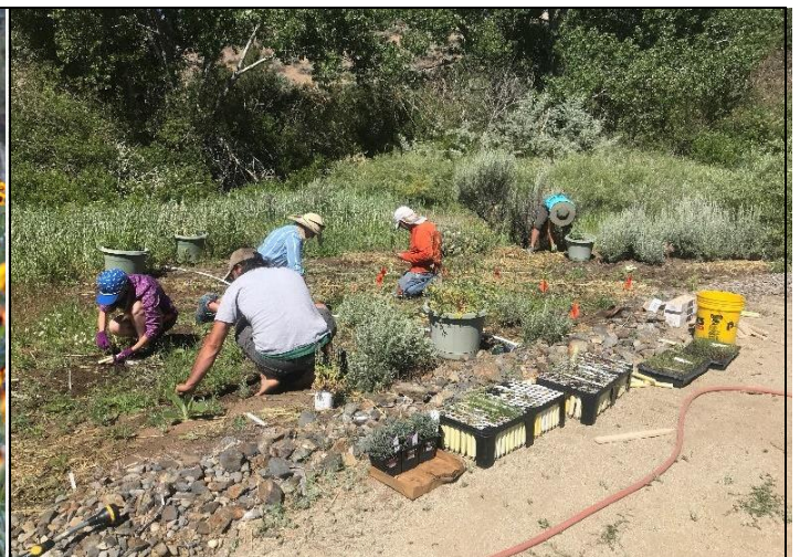
Volunteer work to weed and plant seedlings.