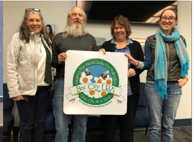
2020 Carson City Bee City USA #76 Executive Committee.