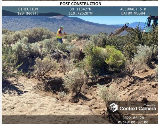
Example before and after photos