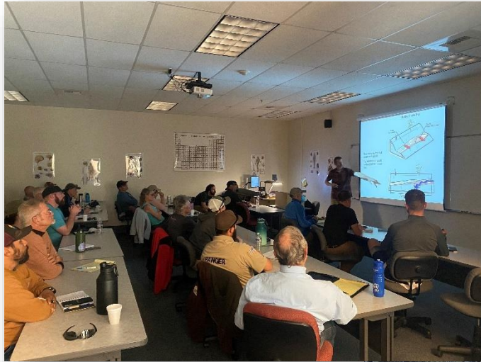
Photos from the Skills Workshop