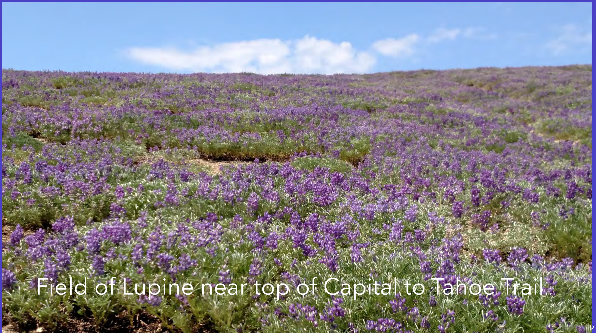
Field of Lupine near top of Capital to Tahoe Trail...