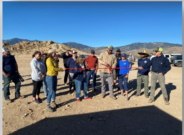
Photos from the OHV Area Grand Re-Opening