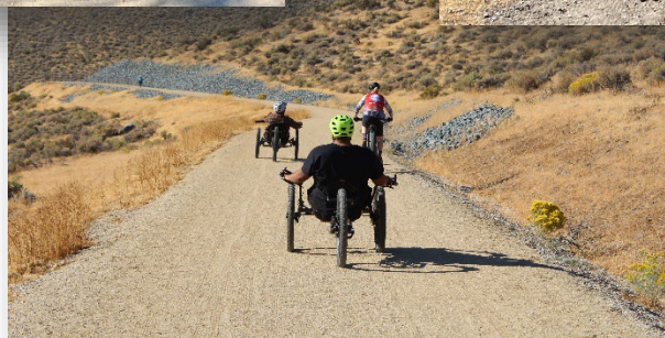
Photos from the Adaptive Mountain Bike Workshop