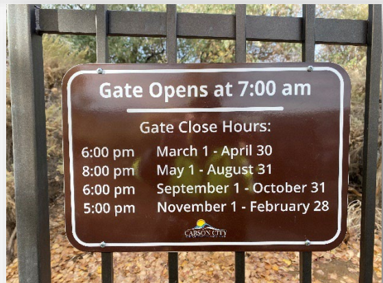
Photos of the new Empire Ranch Trailhead