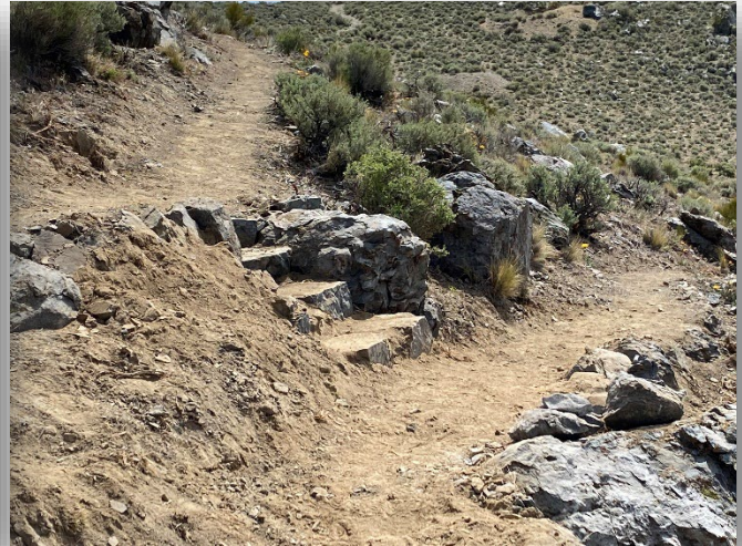
Steps were created in anticipation of hikers likelihood to cut the turn at this location.

Desert Peach Trail – We received 2022 funding from a Recreation Trails Program Grant for $33,712 to build this sustainable connection from the 5 th Street Loop Trails to the North Loop. Construction estimates came in higher than anticipated, so to reduce costs we created an alternative alignment. By raising the average grade from 6% to 7% we were able to eliminate three turns and reduce overall trail length by about 0.5 miles. We are awaiting Section 106 updates before requesting new estimates.